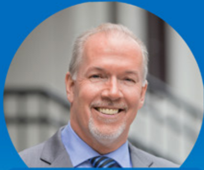
Premier John Horgan