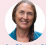
Susie Chant, MLA North Vancouver-Seymour