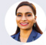
Harwinder Sandhu, MLA Vernon-Monashee