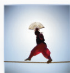
줄타기 Tightrope Performance