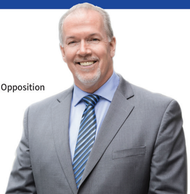
John Horgan Leader, BC Official Opposition