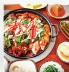
음식 Korean & International Foods