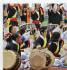
북춤 Drum Dance